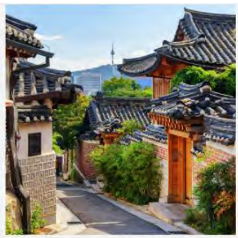
Bukchon Hanok Village